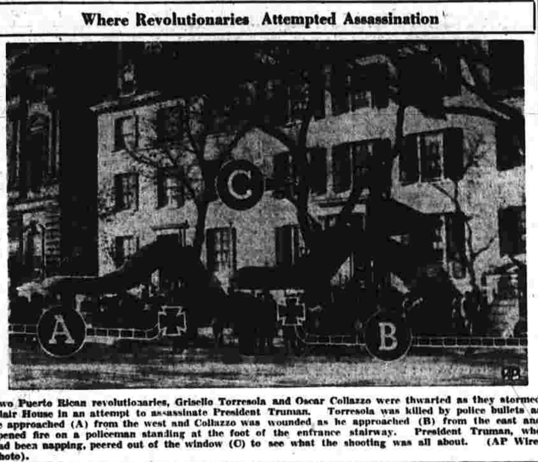
Two Puerto Rican revolutionaries, Griselio Torresola and Oscar Collazo were thwarted as they attempted to assassinate President Truman. Torresola was killed by police bullets as he approached (A) from the west and Collazo was wounded as he approached (B) from the east and opened fire from a platform standing at the foot of the entrance stairway. President Truman, who had been napping, peered out of the window (C) to see what the shooting was all about.

Europe Slated To Have Forty Divisions by '53. France Will Not Drop Opposition to Large German Units in Army of the West. Washington, Nov. 2.—(AP)—French Defense Minister Jules Moch says the Atlantic Pact Nations plan to have 40 divisions on the western front in Europe by 1953.